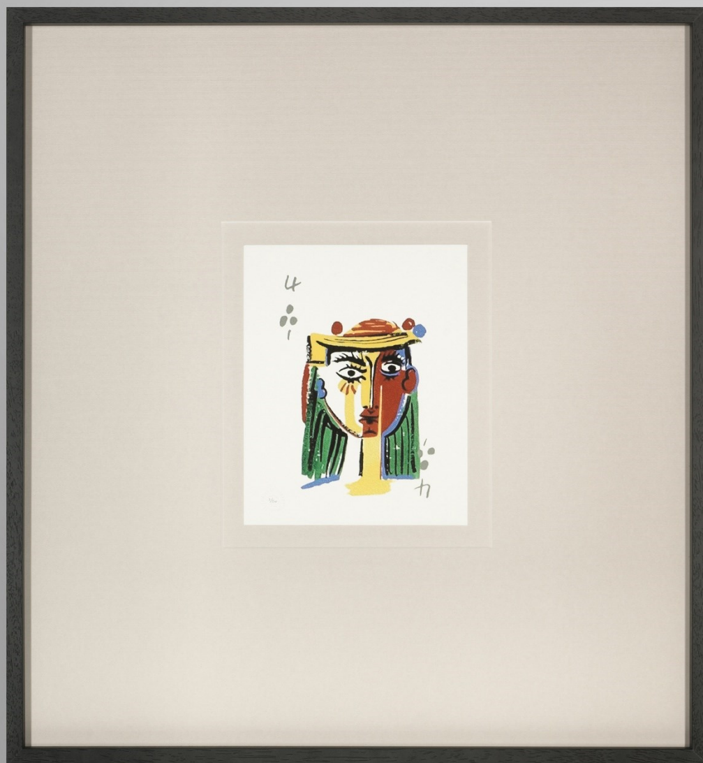
X 380 : 62x67 cm