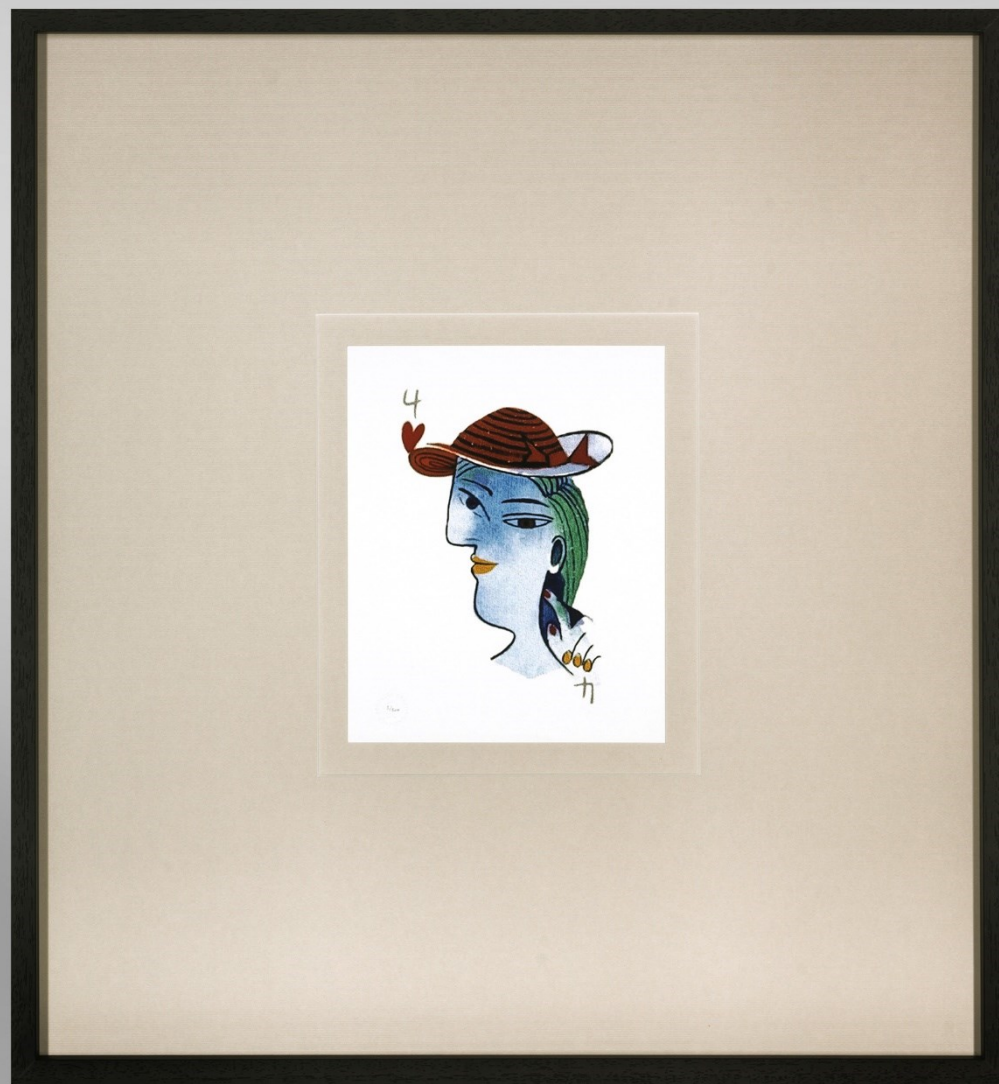
X 383 : 62x67 cm