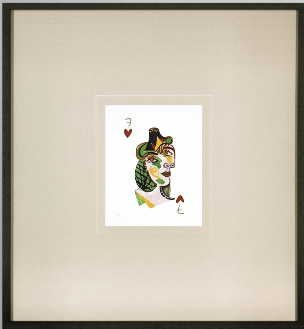
X 382 : 62x67 cm