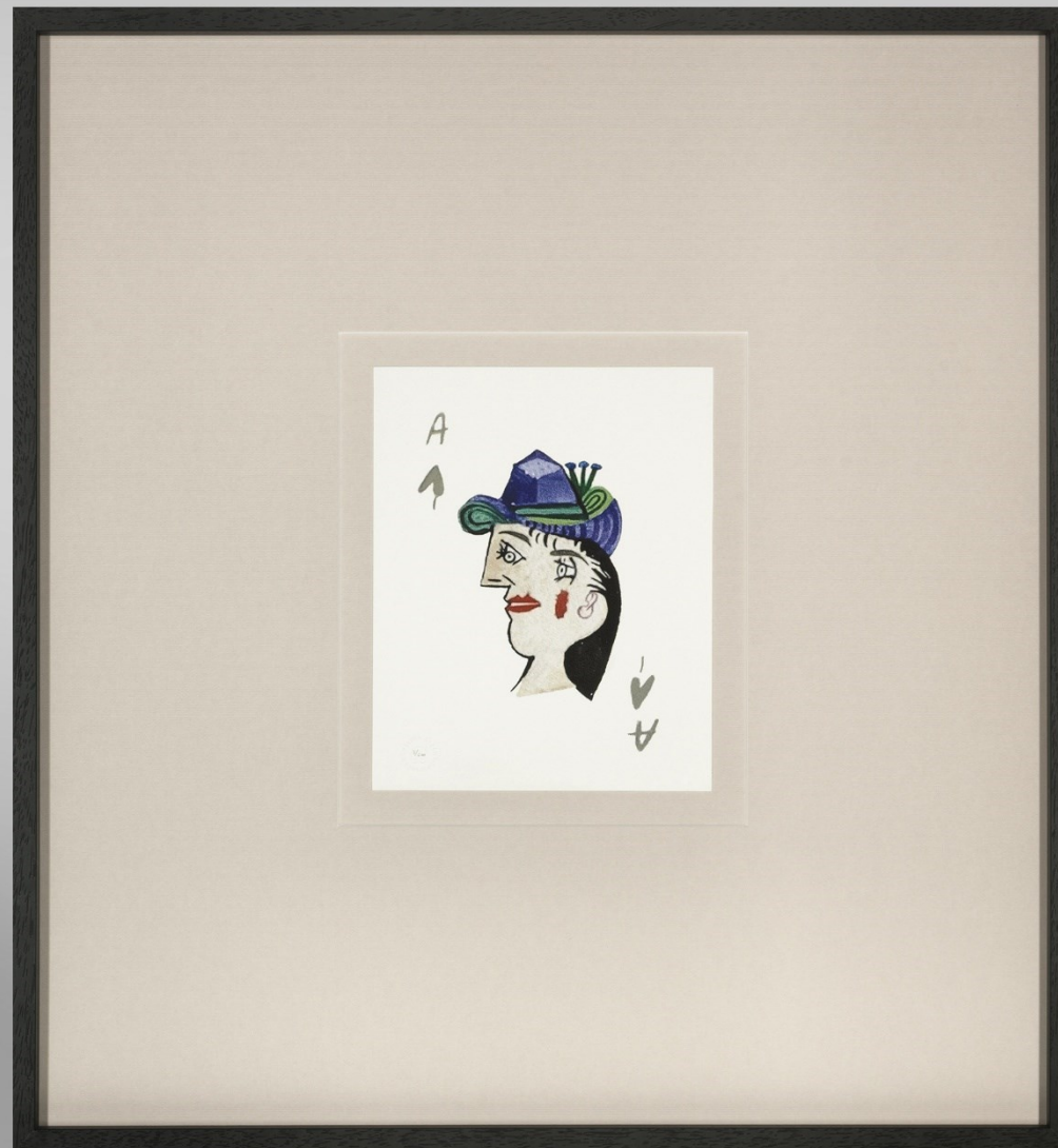
X 385 : 62x67 cm