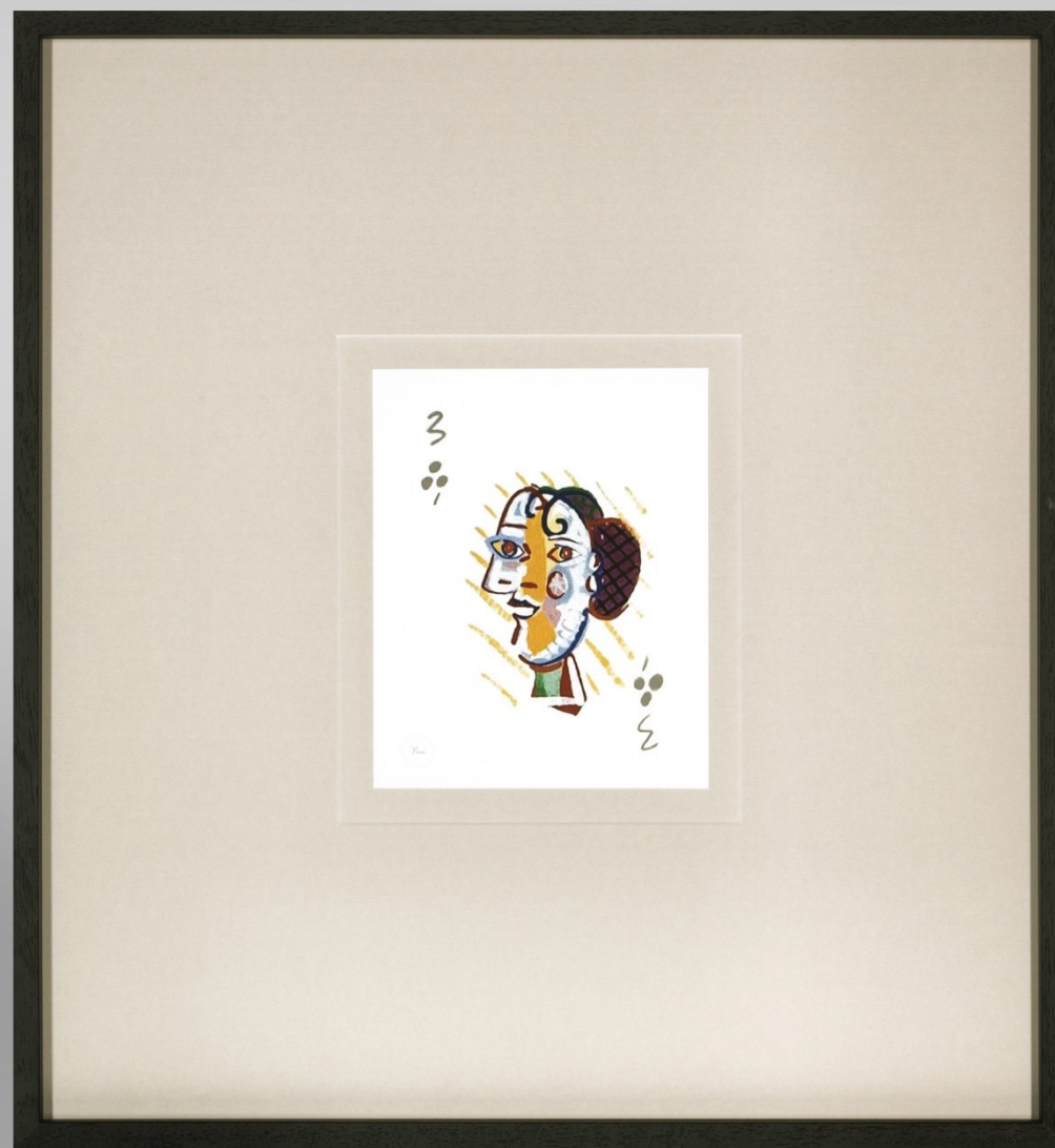
X 381 : 62x67 cm