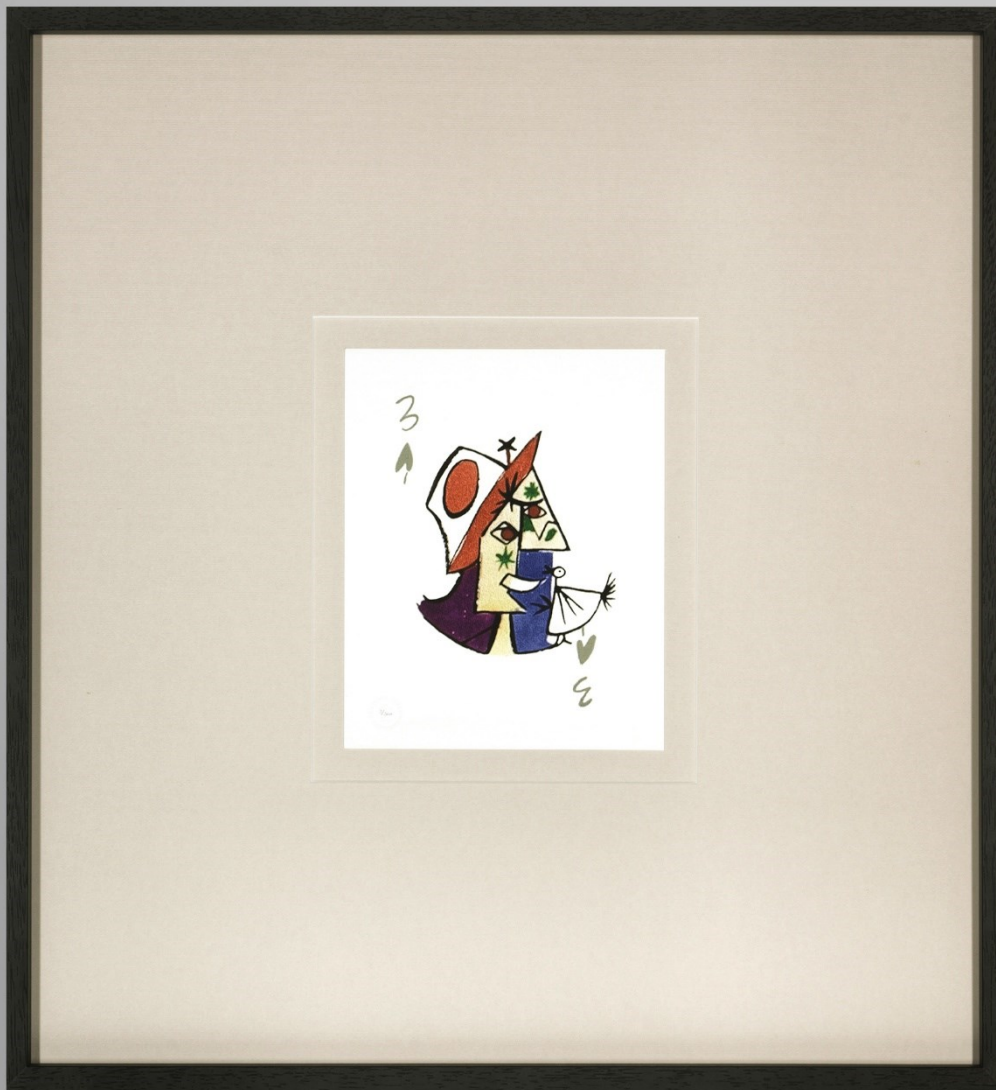
X 384 : 62x67 cm