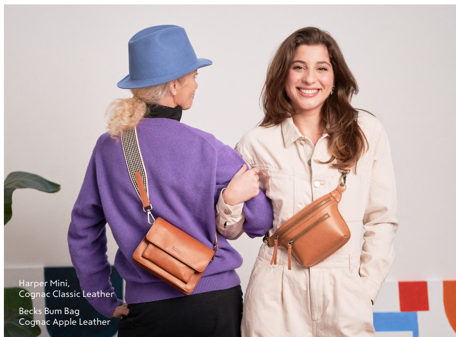
Harper Mini, Cognac Classic Leather