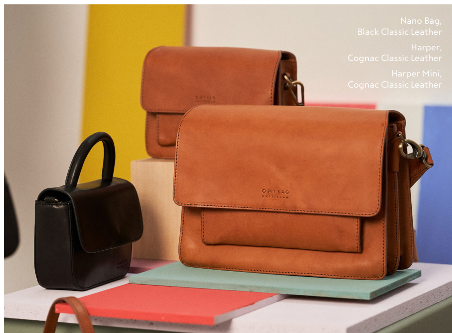
Nano Bag, Black Classic Leather Harper, Cognac Classic Leather Harper Mini, Cognac Classic Leather