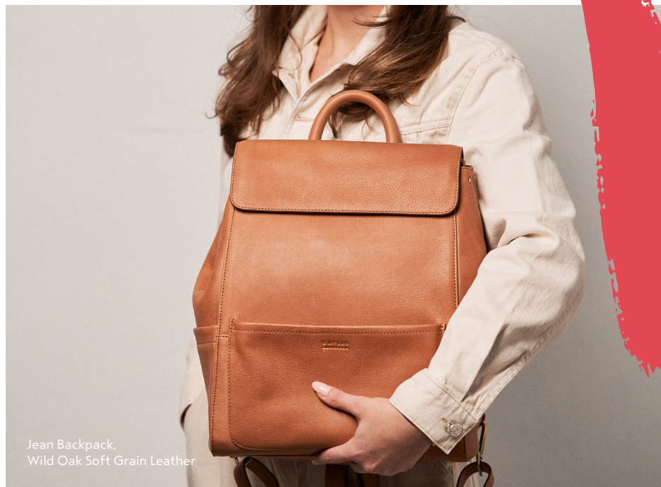
Jean Backpack, Wild Oak Soft Grain Leather